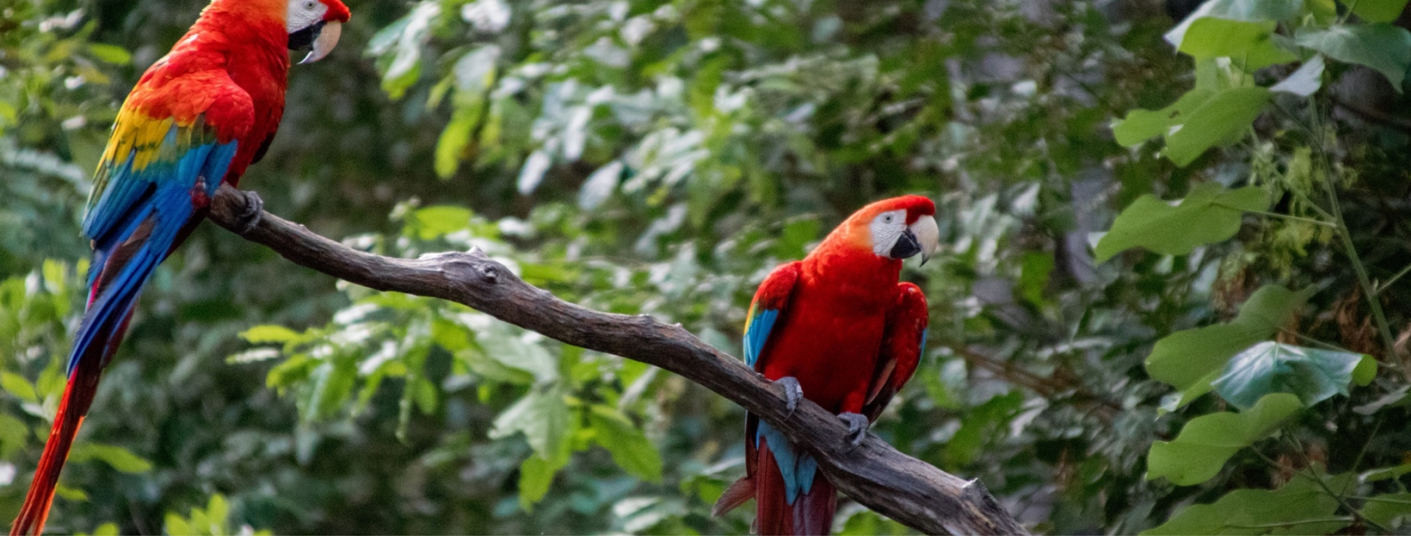
Day 3: AMAZON LIVIN'

Plant medicine, jungle chillin' and water rafting!